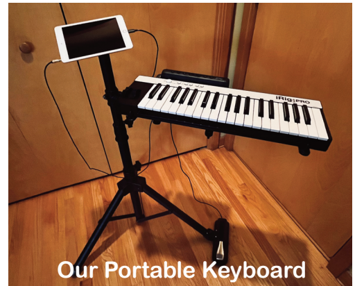
Our Portable Keyboard

We may use your electric piano or may bring one. If so, one vocal mic on a boom stand here, plus a direct box for the electric piano.