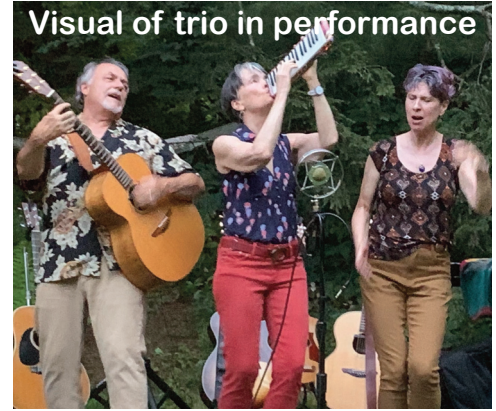
Visual of trio in performance

QUESTIONS CALL OR TEXT: Mark 860-841-9598. The sound engineer should be in touch with Mark 10 days before the scheduled performance.